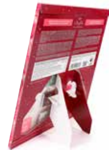
Can be installed using the pre-cut foot on the reverse