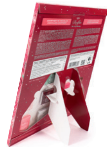
Can be installed using the pre-cut foot on the reverse